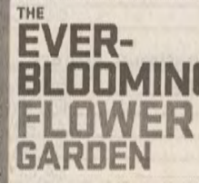
THE EVER-BLOOMING FLOWER GARDEN