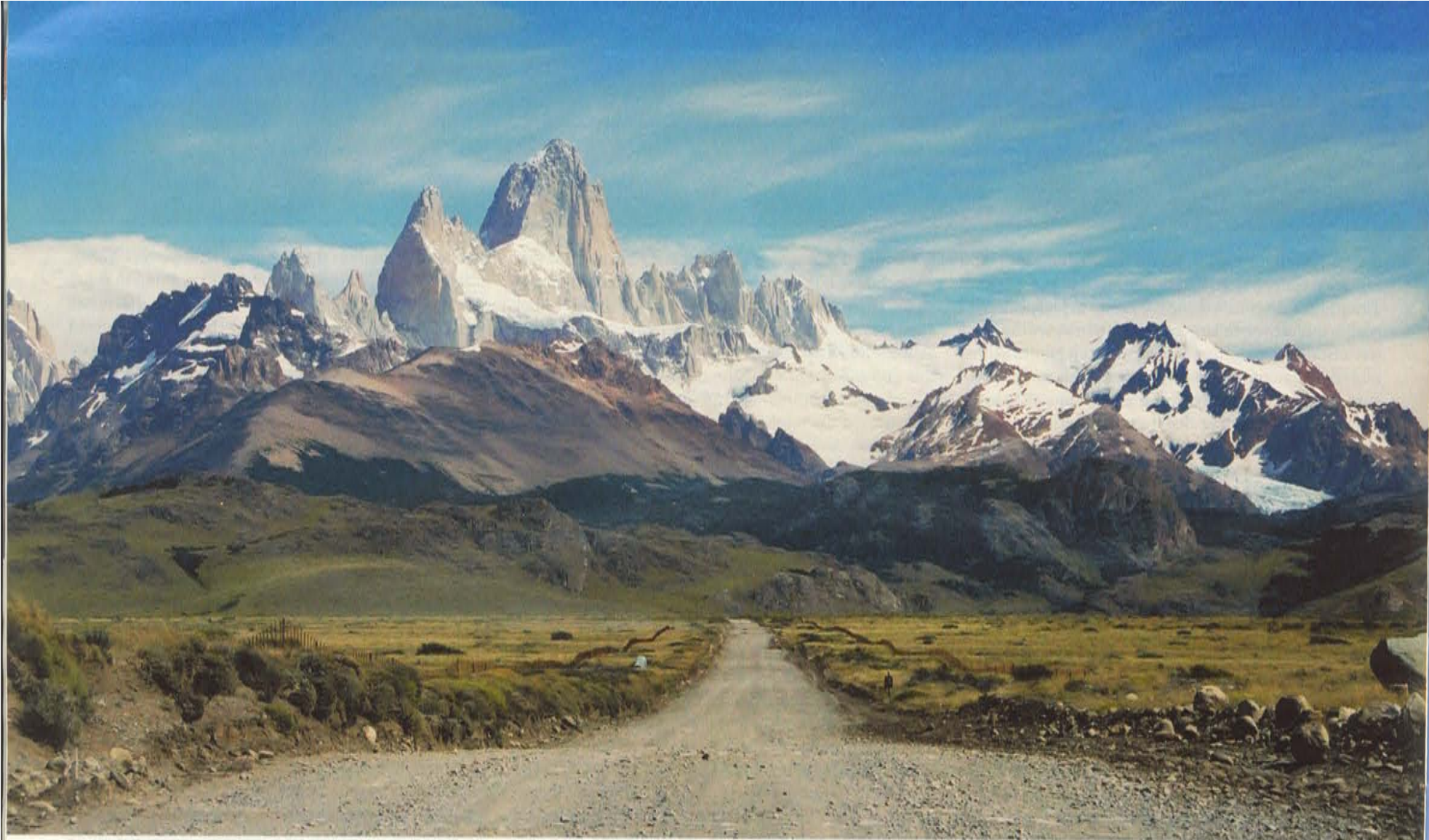
The Fitz Roy group, as seen from the road to El Chalten. This last stretch of road, as well as the streets of El Chalten will soon be paved, forever changing the atmosphere of this wild, remote place.