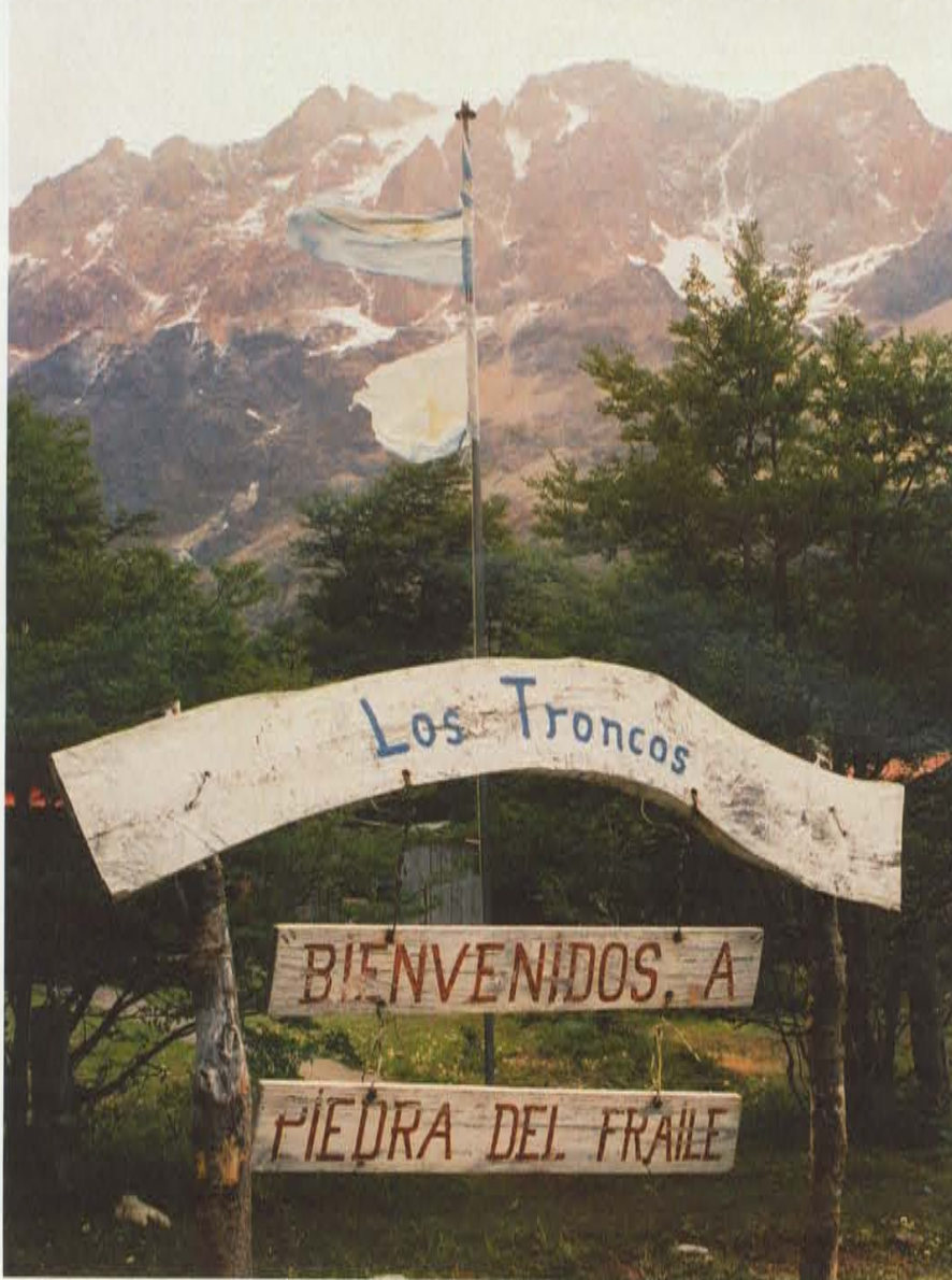
The entrance to Piedra Fraile. Cerro Electrico and the eastern slopes of the Fitz Roy group loom in the background.

"Are you having fun waiting...?" His words were cut short as his giggling children tackled his legs. He darted off, chasing them with his arms in the air.