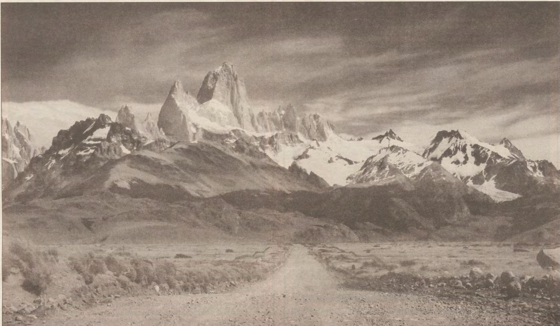
Road to Chalten in Southern Patagonia, Argentina – home to many climbers and backpackers.